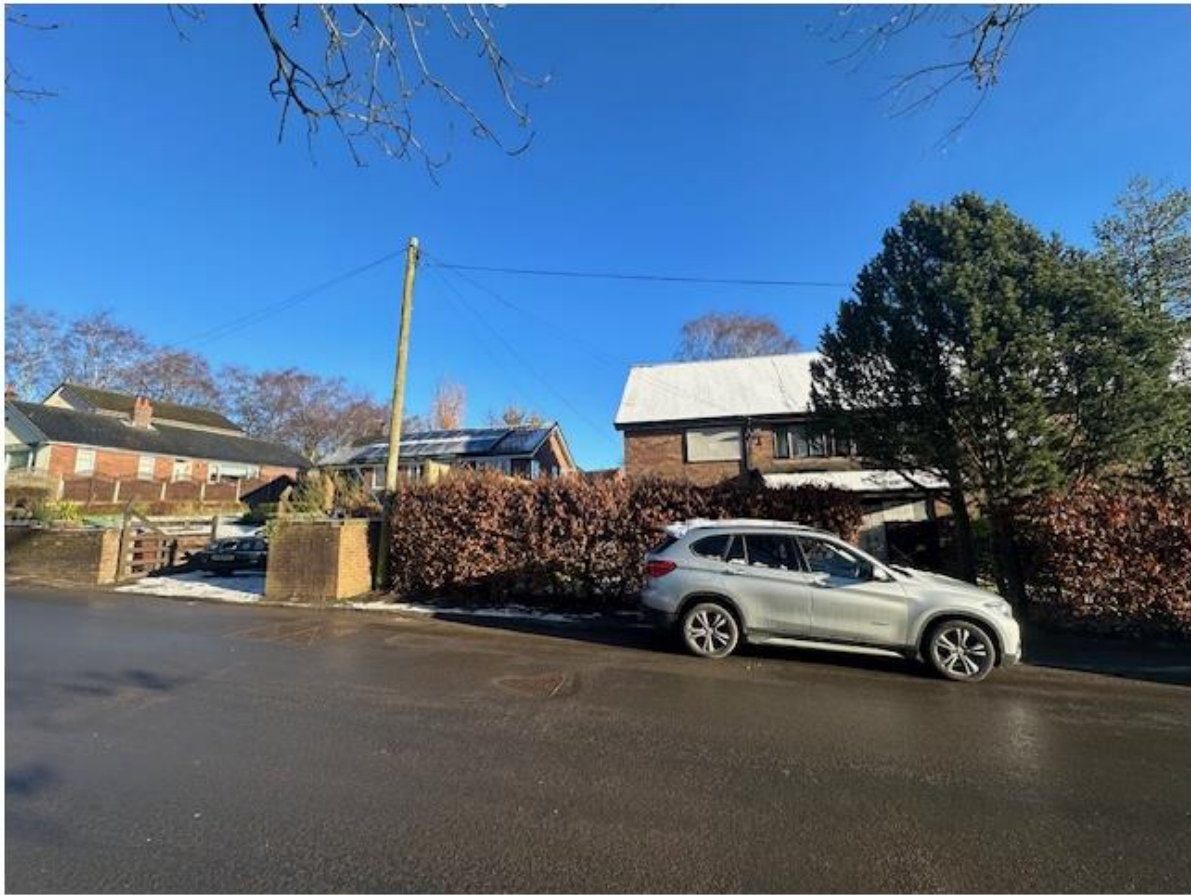
Image 4: view of Spring Court Mews from existing hardstanding area to south of plot