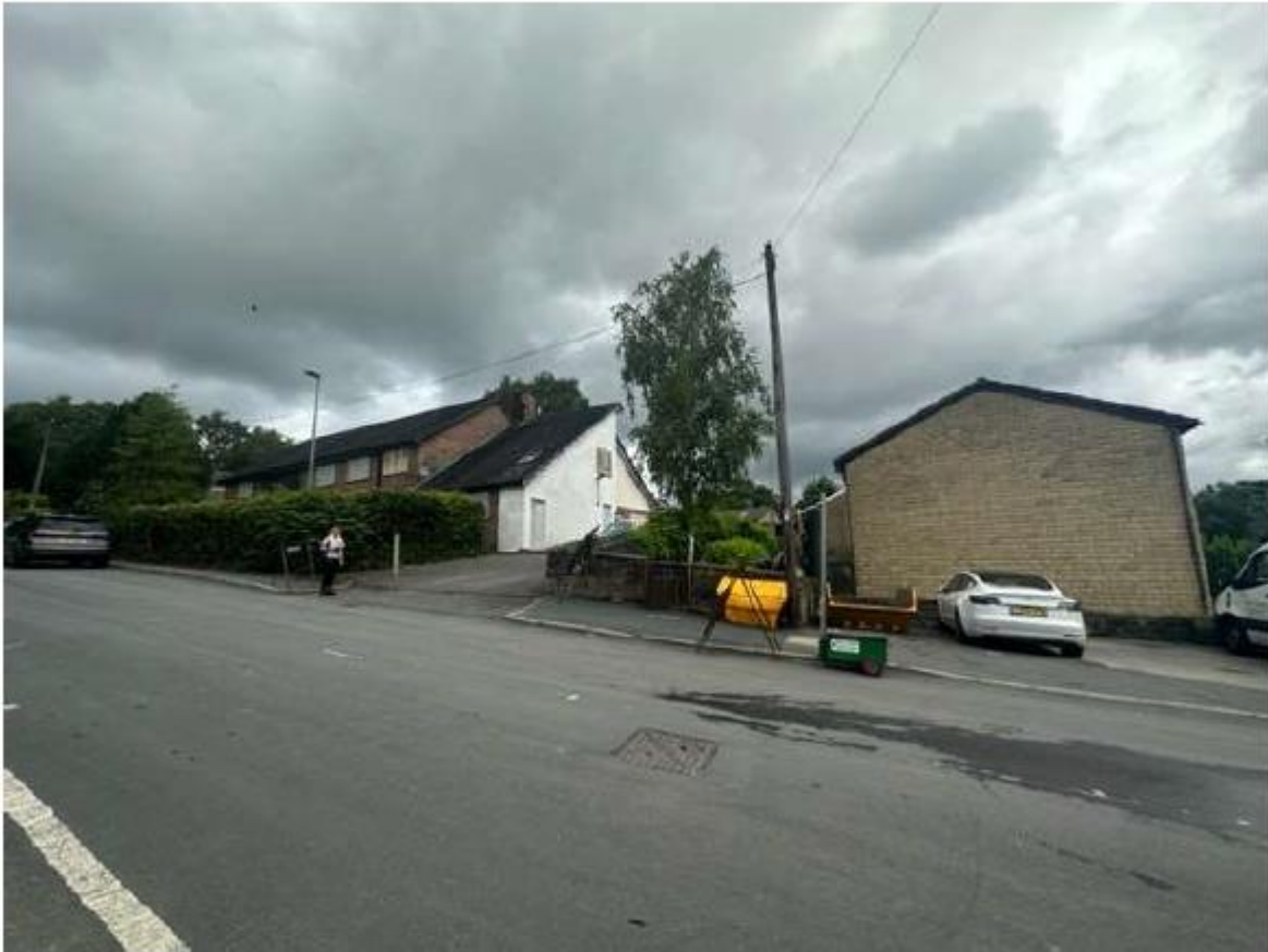
Image 6: Existing gable end of The Hollies facing Spring Court Mews